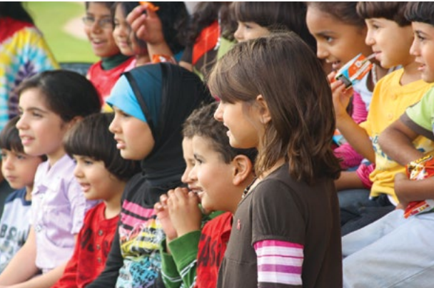
Weekend Islamic School